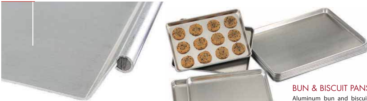
Wire Reinforced Rims

All bun pans are not created equal. Ours are at the top of the list, featuring strong wire-reinforced rims and a high quality surface finish in aluminum alloy with fully rounded corners for easy release and cleaning. Ideal for baking or display and fits standard bakers' racks. Choose from a wide variety of thicknesses to fit your needs. Also now available in perforated quarter, half and full size pans for special baking applications.