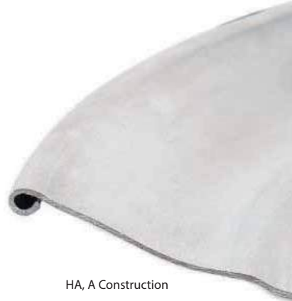
HA, A Construction

Five varieties with the Eagleware trademark of quality, durability, and versatility. The thickness keeps them sturdy for extensive use and good looks, making them perfect for dining presentation. The "A" and "HA" series are standard sloped rim trays, "FHA" is our flat rim tray, and "HSA" and the "SA" series are continental "coupe" rim trays. They are made of .032" (.8 mm) and .040" (1 mm) (heavy-duty) thick aluminum alloy. The edges are rolled to eliminate the problem of hard-to-clean openings.