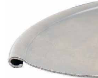
HSA, SA Construction